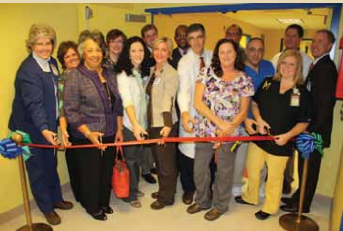
Grand Opening of Pediatric Radiology

The Children's Hospital takes pride in caring for children in a child-friendly, non-intimidating environment. Children respond better in an atmosphere where they feel comfortable and in November 2010, The Children's Hospital welcomed the newest addition to its services, Pediatric Radiology. Although, this has been an existing service of The Children's Hospital, children can now receive inpatient and outpatient X-Rays and radiology treatments in The Children's Hospital building itself. Located on the lower level of the Hospital, the expansion and renovation project was funded by monies raised in 2010. Last year over 10,000 children received pediatric radiology services and, thanks to the generosity of The Children's Hospital's donors, this expansion will enable more children to receive treatments close to home in a child-friendly environment.