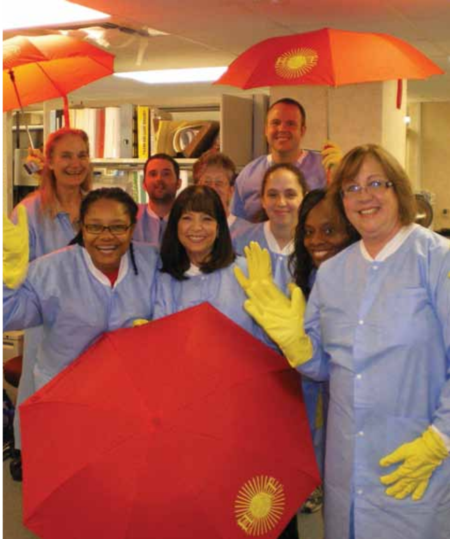
Employees of the Laboratory give a HEAT Wave.

On behalf of the men, women and children of our community whose lives have been touched by the generosity of our H.E.A.T. members, the Medcen Board of Trustees, along with Administration and the Medcen Staff, thank you for sharing your resources as well as your skills.