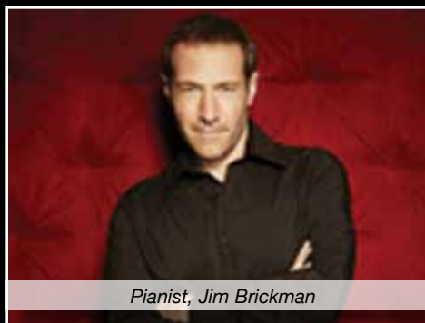
Pianist, Jim Brickman